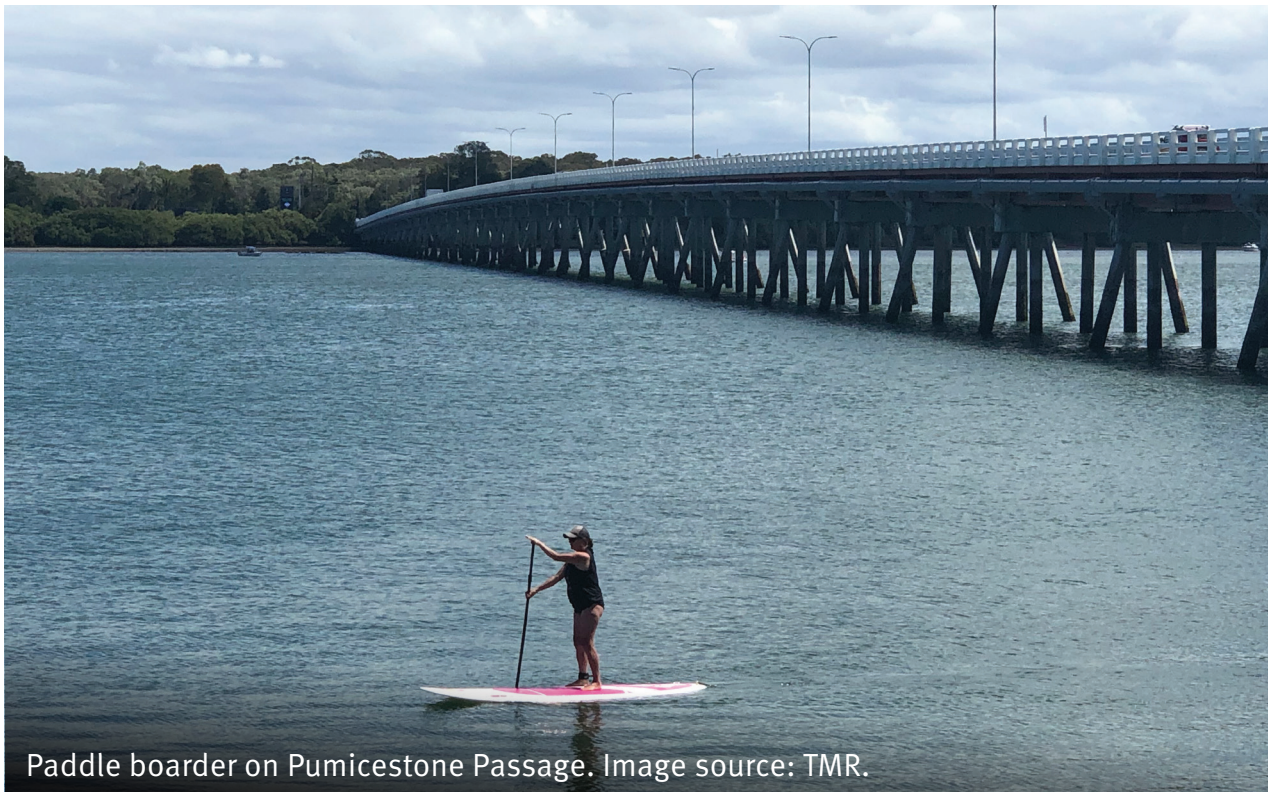
Paddle boarder on Pumicestone Passage.

Respondents asked for environmental impacts to be minimised through design including limiting the project footprint and considering opportunities for environmental improvements. Respondents asked for construction and operational impacts such as noise to be minimised.