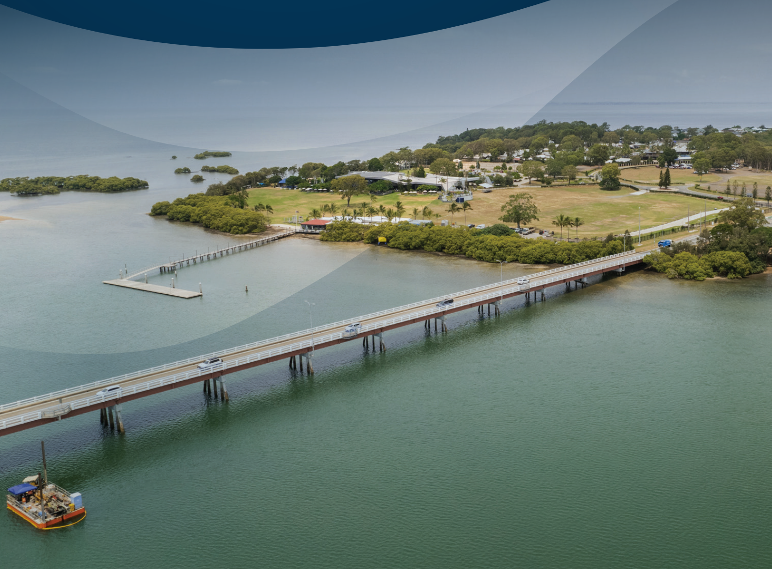
Aerial view of the existing Bribie Island Bridge.